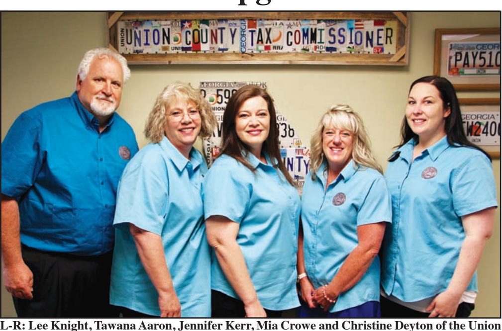
County Tax Commissioner's Office.