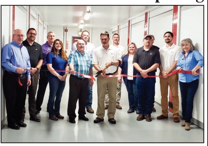
The Blairsville-Union County Chamber of Commerce held a ribbon cutting ceremony for the Grand Re-Opening of Cobb Vantress on May 11.

And 20 years on, the hatchery is still going strong in Blairsville, though the company decided recently to replace the equipment at the site with updated, more modern machinery – hence